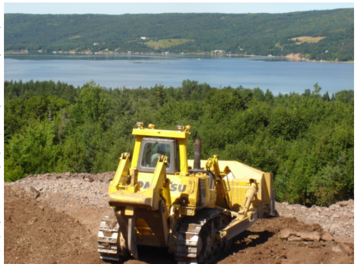
A D10 moves some earth on #6 tee