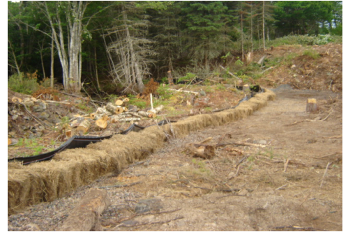
Stream protection on # 7